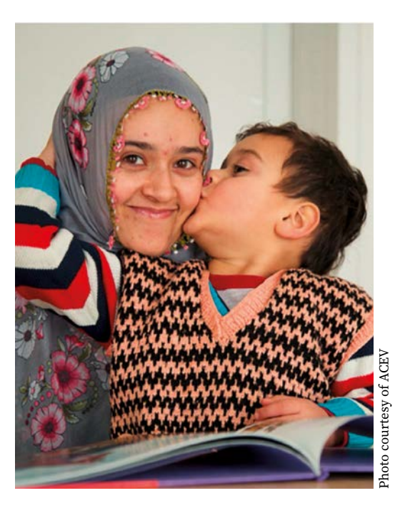
MOCEP has positive effects both on the child and on the mother.

However, from a feminist/women's rights perspective, this mother-centred programme has two disadvantages: it increases a mother's unpaid family work, as she is entrusted with the implementation of the CEP; and it reinforces gender stereotypes about the place of the woman in the home.